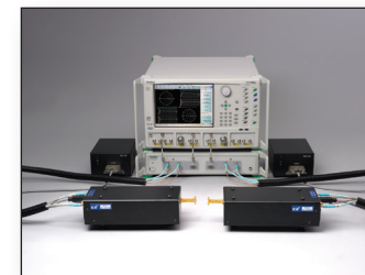
Compatible with VDI and OML modules for frequencies above 110 GHz (VDI shown)